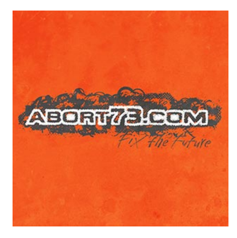
SOCIAL MEDIA GRAPHICS:

Abortion persists because of ignorance, apathy and confusion. Abort73 is working to change that; you can help! Get started below: